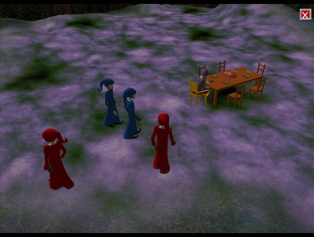
Figure 3: Dinner Ritual (High Power Culture) - Elder sits first in the fancy chair.

if so, if they understood those differences as being caused by the culture of the character, or by their personalities, or by neither one of these factors. Finally we asked users their gender, age, and nationality. We had 41 participants aged between 18 and 40 years old of which 73% were male.