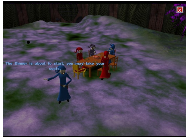
Figure 2: Dinner Ritual (Low Power Culture) - Characters rush to the table.

to the characters that the dinner will start and everyone should take their seats. Then the ritual proceeds with the characters seating at the table and starting to eat. However, while in the low power culture everyone rushes to the table immediately, not even waiting for the host to finish the announcement (see Figure 2), in the high power culture everyone has to wait first for the elder to sit before they can sit (see Figure 3), and then have to wait for the elder to start eating before they can eat. Moreover, the elder in the high power culture has the privilege to sit in the more fancy chair.